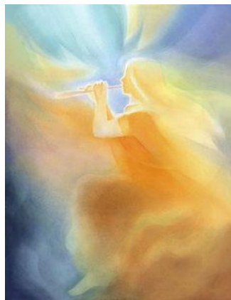
A Waldorf Painting

My self threatens to escape lured by the power of cosmic light.