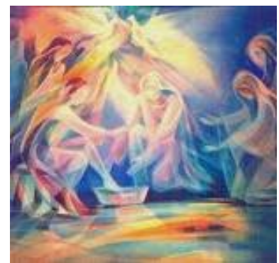
Leszek Forczek - Washing of the Feet

With the soul experiencing light throughout the year in the four different ways, each of us as an individual soul also works in the world as a light-filled heart in different ways as the year proceeds. A quotation from Rudolf Steiner's lecture to young doctors, Nov 30, 1919, applies to all the light verses: "with every breath of air, we take not only air but also light into ourselves, and we transform this light within us and make it our own as we do any other substance: we digest it, we make it an integral part of our self."