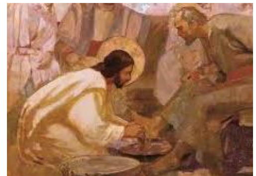
Love each other as I have loved you