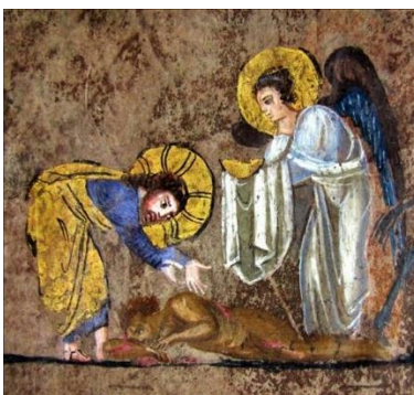
The good Samaritan

Earnestly the soul wishes to kindle the "fiery forces of the Cosmic Word, filling our deeds of human loving and working, and bringing the creative fire power from Christ to a new active level of love for "right activity." This is the time to show our love, show its power of transforming relationships—even of the world, out of the heart's new, high sense of responsible creativity.