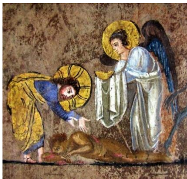
..... The good Samaritan

Earnestly the soul wishes to kindle the "fiery forces of the Cosmic Word, filling our deeds of human loving and working, and bringing the creative fire power from Christ to a new active level of love for "right activity." This is the time to show our love, show its power of transforming relationships—even of the world, out of the heart's new, high sense of responsible creativity.