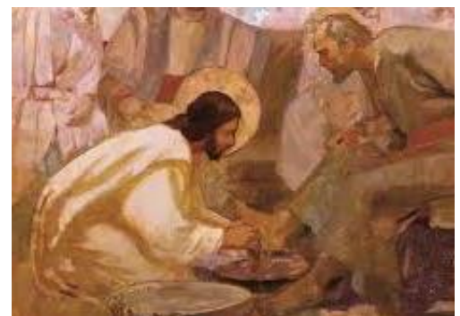
Love each other as I have loved you

"If we are grounded in Christ, we bear within us the pattern of a true social order, in that the