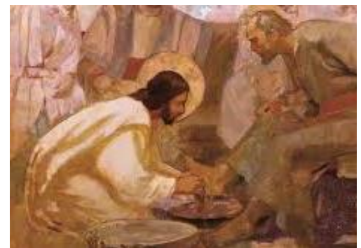
Love each other as I have loved you