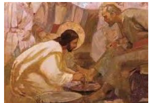
Love each other as I have loved you