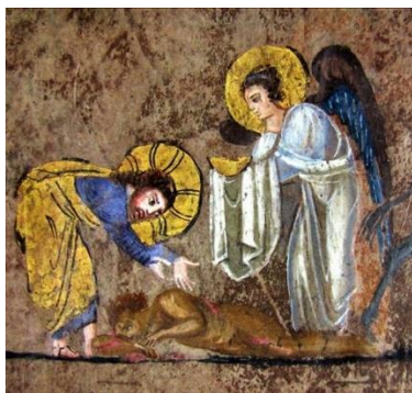
..... The good Samaritan

We're striving to kindle the "fiery force of the Cosmic Word to fill our deeds of human loving and working," bringing the fire power from Christ to a new active level of love for "right activity." This is the time to show our love, show its power of transforming relationships—even of the world, out of the heart's new, high sense of responsible creativity.