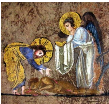
..... The good Samaritan

We're striving to kindle the "fiery force of the Cosmic Word to fill our deeds of human loving and working," bringing the fire power from Christ to a new active level of love for "right activity." This is the time to show our love, show its power of transforming relationships—even of the world, out of a high sense of responsibility.