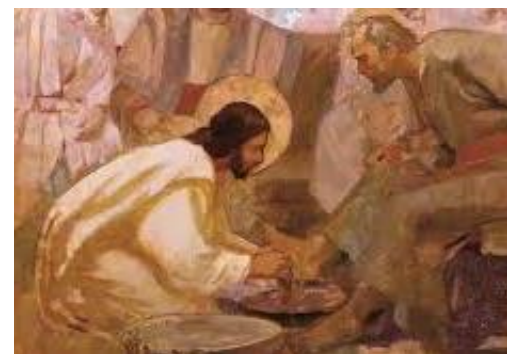
Love each other as I have loved you