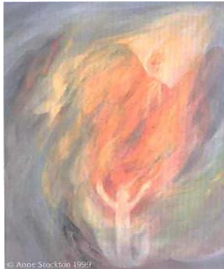
original German by Rudolf Steiner