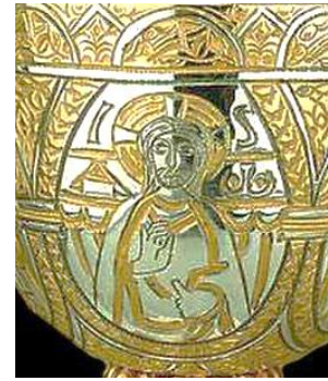
From the Tassilo Chalice Bavaria c. 780

with the higher self with which it had been united in the spiritual world. This fact explains why descriptions of the Luke child tell of the pure love the boy showed to all while apparently lacking any earthly aptitude. He brought with him the higher self that normally stays in the spiritual world at birth, raying into a new human child but not incarnating.