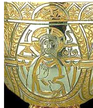
From the Tassilo Chalice Bavaria c. 780