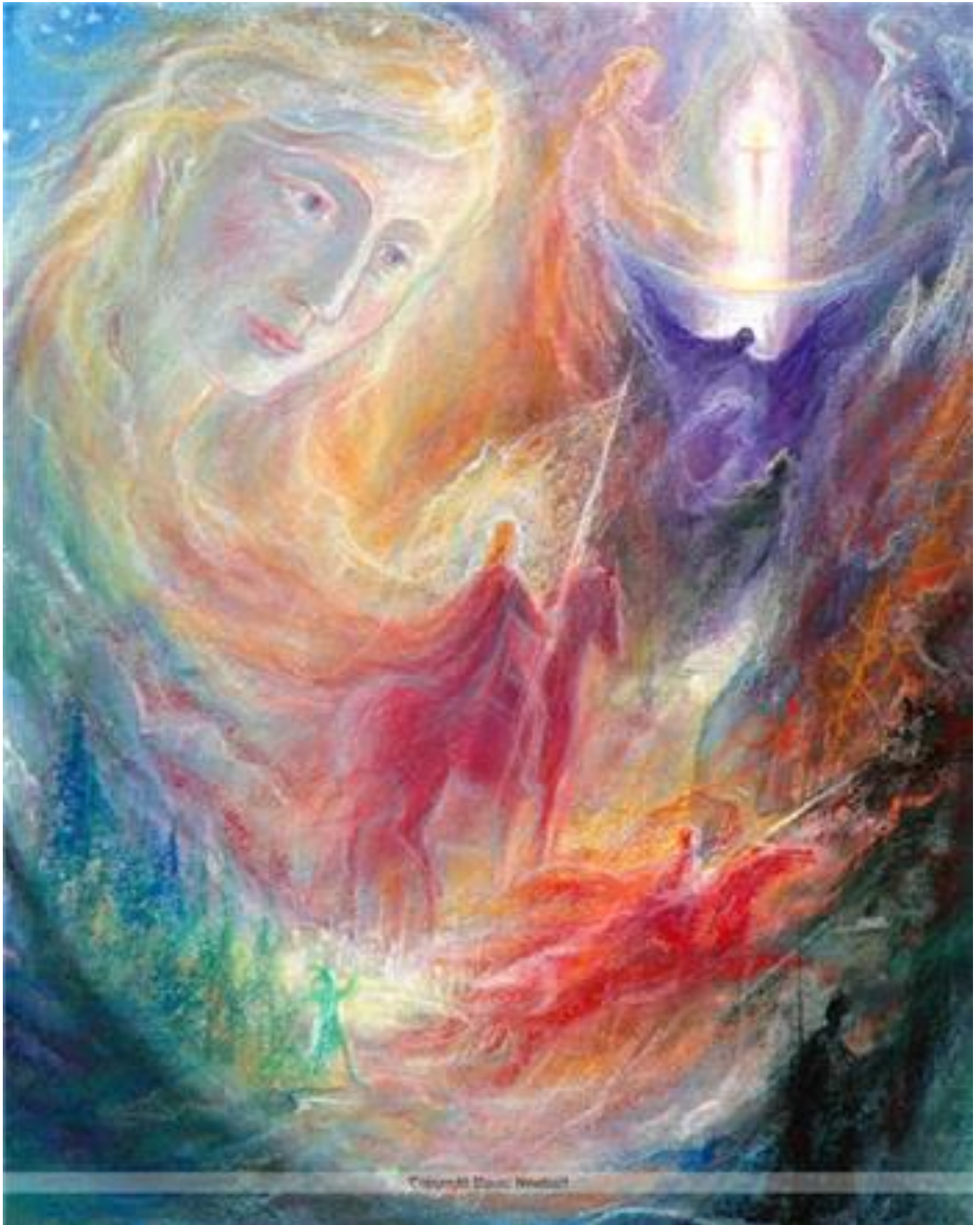
Vincent van Gogh, 1888