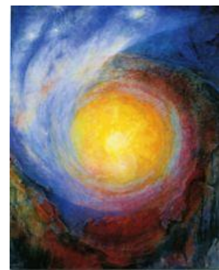
Birth - Ninetta Sombart