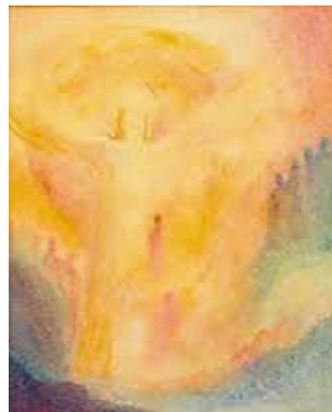
Supersensible School of Michael

O Nature, your maternal being I bear within the essence of my will, And my own will's dynamic fire power, It steels my spirit's driving forces That they give birth to Sense of Self To bear my Self in me.