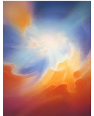
A Waldorf painting

Now may I be unto myself And luminous, spread inner light Into the darknesses of time and space. All Nature-being tends toward sleep; The depths of soul shall now awake And waking bear the warm sun-glowing To freezing winter flowing.