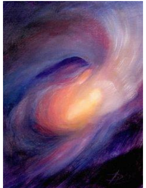
Liane Collot d'Herbois

'Turn your will about, let it get as powerful as possible, yet do not let it stream as yours into the things but inquire for the essence of the things and then give them your will; let yourself and your will stream out of the things. —as long as you impose your wish upon a single thing, this your wish not having been born out of the thing itself, so long do you wound the thing."