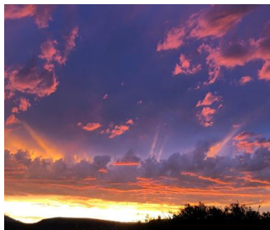
in NE Nevada 6'24'20

I feel as if enchanted In worldly glory, Spirit's weaving: It has, in senses' darkness Enfolded my own being, So it might grant me strength: Which, powerless to give myself My "I" is in its narrow bounds.