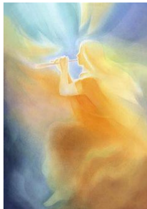
A Waldorf Painting

My self threatens to escape lured by the power of cosmic light. Enter here my divining heart assume your rightful place. Restore in me the strength of thinking which in the shimmering sense world is now inclining to lose itself.