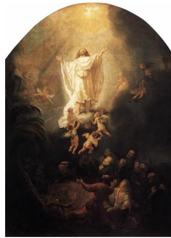
Rembrandt – The Ascension painted in the Late 1630's