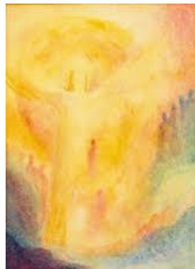
Supersensible School of Michael

O Nature, your maternal being I bear within the essence of my will, And my own will's dynamic fire power, It steels my spirit's driving forces That they give birth to Sense of Self To bear my Self in me.